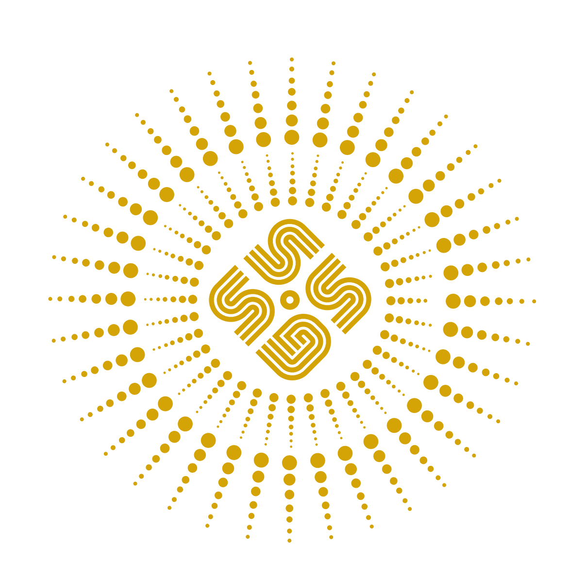
CONFERENCE ON SUSTAINABLE SOURCING IN THE GARMENT SECTOR